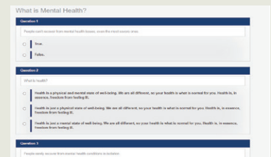
Final exam - certificates provided.

One in four people experience some form of mental health issue over the course of a year. They may experience mental health issues to varying degrees.