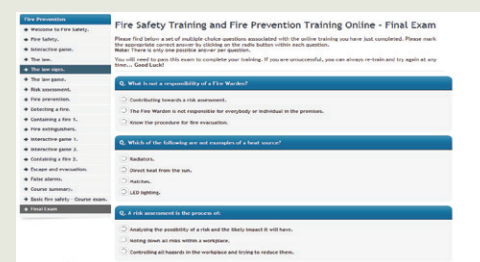
Final Exam – Certificates Provided.

Those responsible for workplaces must provide staff with suitable, sufficient and appropriate training to help prevent the outbreak of fire.